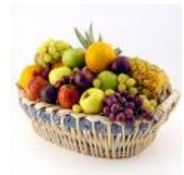
A healthy food choice

Yes, their names are Systolic (the top number) and Diastolic (the bottom number). Normal reading is 120/80.