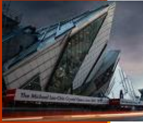
The Royal Ontario Museum

On Monday, 26 May, 2008, the students together with our teachers went to the Royal Ontario Museum. The events team planned the trip.