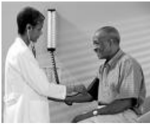
Have your blood pressure tested regularly

You have heard of SARS, Asian Bird Flu, and West Nile Disease. Yet none of all these threats has come anywhere close to the numbers of deaths of the 'Silent Killer'- Heart Disease. Heart disease is one of the number one killers of Canadians, says The Heart and Stroke Foundation. What are some of its features? What do we look for in order to lessen its risks?